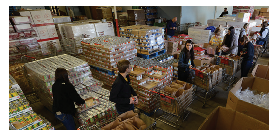
December 2015 - Students from a local high school pack bags of groceries for Operation Santa Claus.

Your participation in the inaugural Operation Santa Claus Golf Outing will help us make this holiday season a little brighter for your neighbors!